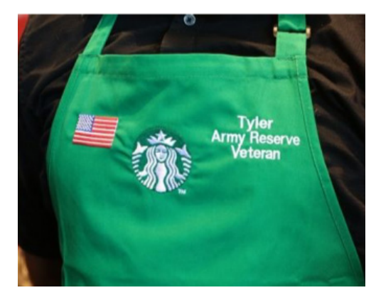
Graphic:Veteran and Military Spouse Apron

Starbucks believes that veterans and military spouses are instrumental in strengthening the Company and community through leadership, service, and civic engagement.<sup>87</sup> For this reason, Starbucks has dedicated special stores to support military families.<sup>88</sup> These stores are staffed with many veterans and military spouses and partner with non-profit organizations to provide services for veterans and their families.<sup>89</sup> When Starbucks