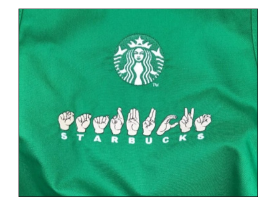
Graphic:American Sign Language Apron

As part of its ongoing commitment to inclusion, accessibility, and diversity, Starbucks opened its first U.S. Signing Store in Washington, D.C. in October 2018.<sup>92</sup> All twenty-five partners are fluent in American Sign Language (ASL) which helps partners connect with the Deaf and hard of hearing community.<sup>93</sup> The Signing Store also provides employment and career opportunities for Deaf and hard of hearing people.<sup>94</sup> Deaf and hard of hearing partners wear ASL aprons embroidered by a Deaf supplier, and hearing partners wear "I Sign" pins.<sup>95</sup>