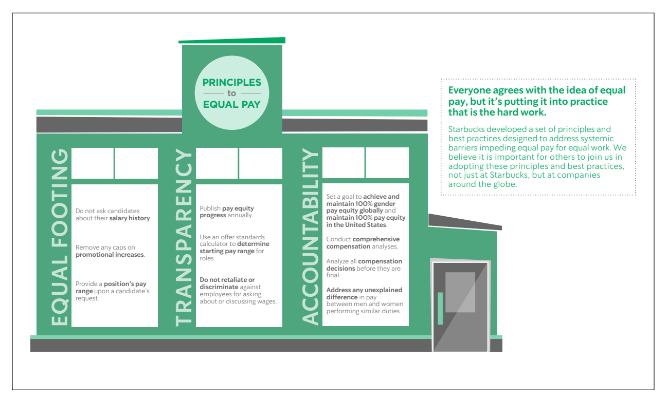
Graphic:"The Path to Equal Pay" infographic by Starbucks

In 2018, Starbucks achieved 100 percent pay equity in the U.S. for women and men and people of all races for partners performing similar work.<sup>60</sup> This work was built on the foundation of Starbucks' pay equity principles, which include ending the practice of asking applicants about salary history and providing salary ranges to any candidate who requests it. Starbucks understands that it is not enough to achieve pay equity—the Company must maintain it. Starbucks has committed to continually monitoring partner compensation to ensure that disparities do not occur.